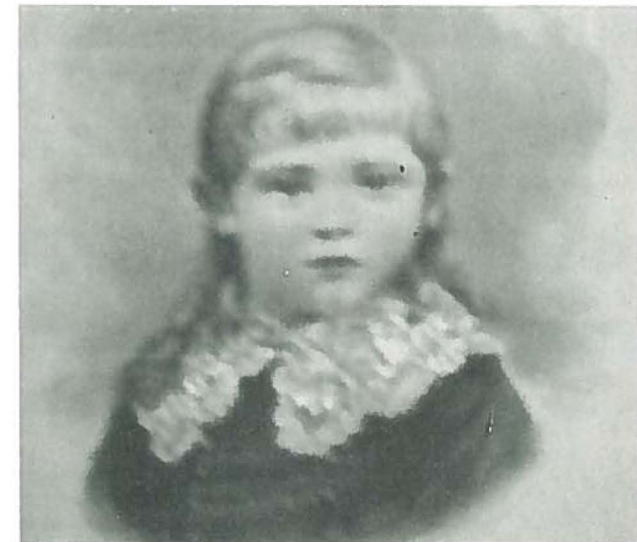
Does anyone know who this cute little boy is?